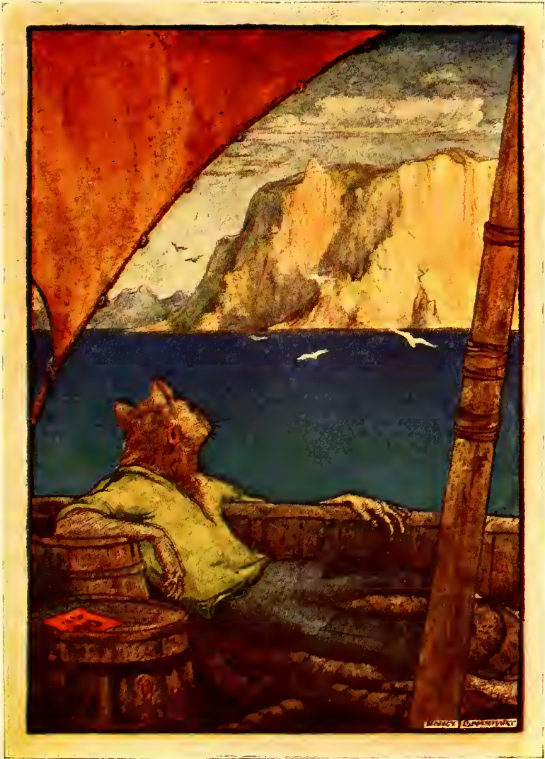
THOSE WERE GOLDEN DAYS